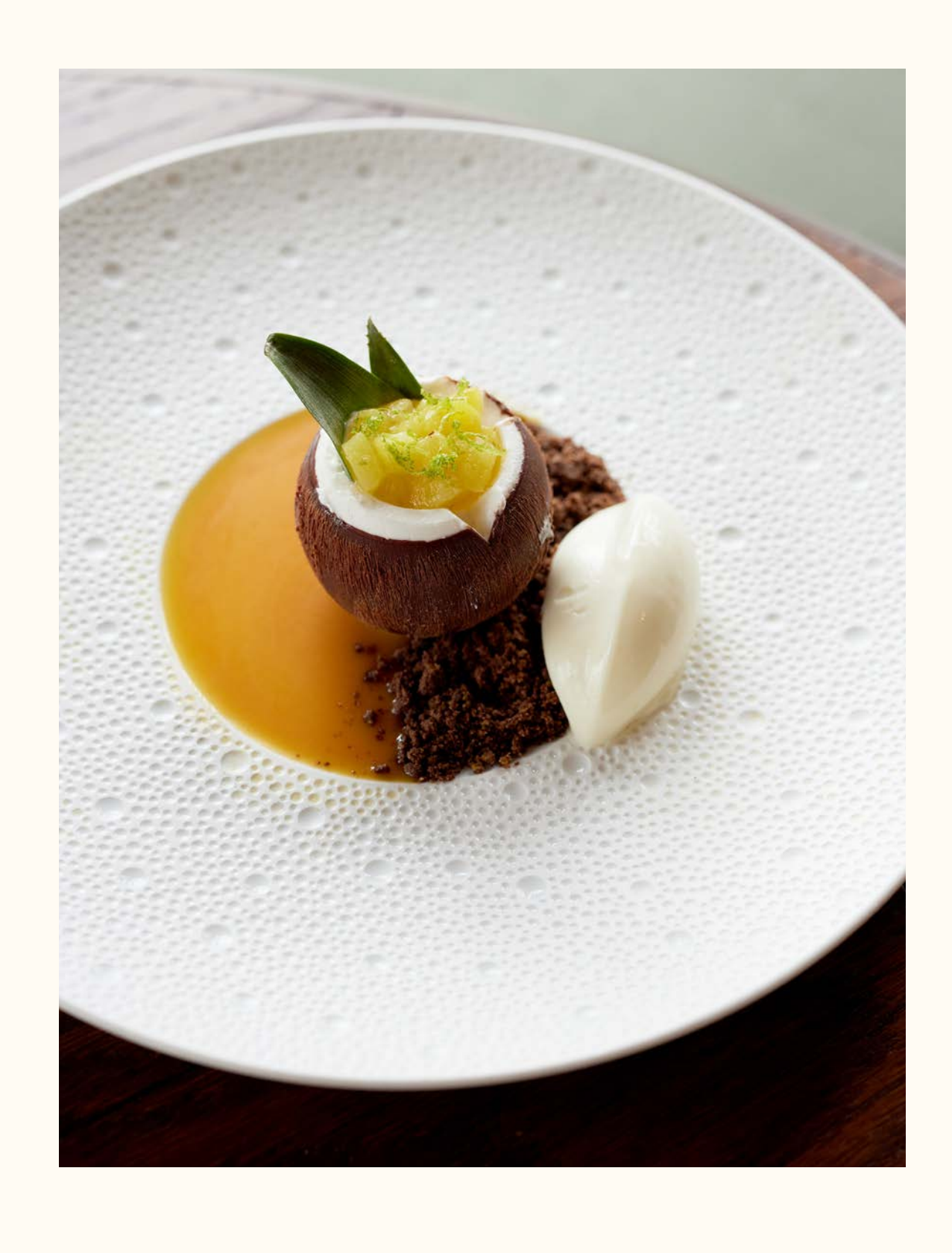
Top Exotic Coconut **Right Scallops Carpaccio